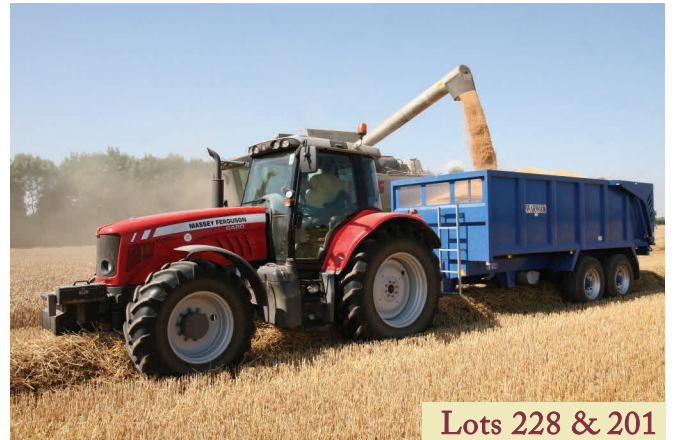
Lots 228 & 201