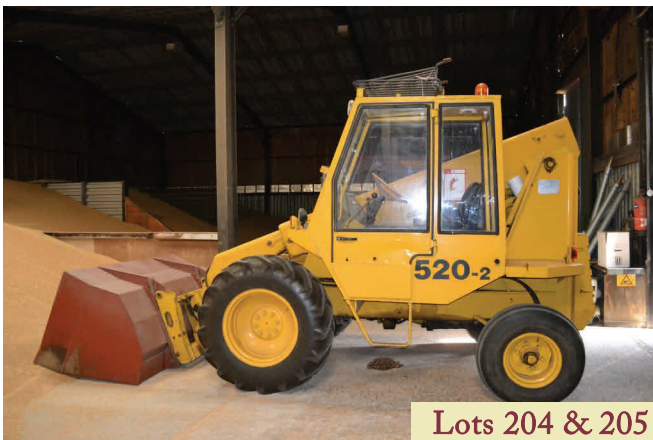
Lots 204 & 205