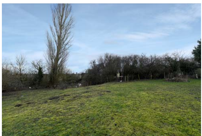
1 Turnpike Cottages, Norwich Road, Brockford IP14 5NS

Kitchen/dining room and sitting room. Two bedrooms and landing bedroom/study. Bathroom.