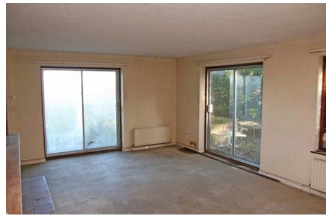
The Rectory, Mill Road, Waldringfield IP12 4PY

Entrance lobby, entrance hall, 22' sitting room, dining room, study, kitchen/breakfast room, utility room and cloakroom. Four bedrooms and bathroom.