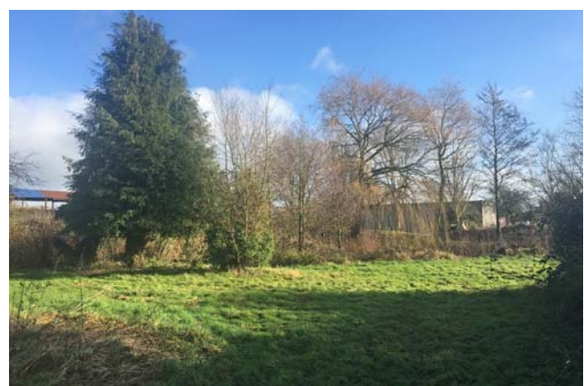
Grove Farmhouse, Grove Lane, Ashfield IP14 6LZ

Scullery, kitchen, bathroom, dining room, drawing room and sitting room. Currently five first floor bedrooms plus attic rooms. Grounds, including substantial pond, of 0.8 acres.