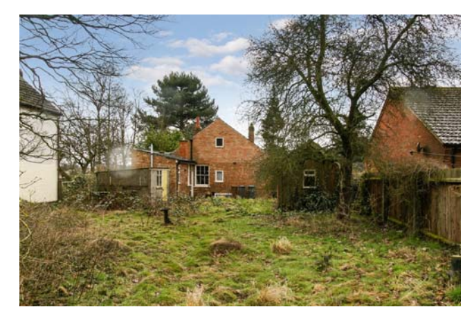
Fairhaven, Felixstowe Road, Nacton IP10 0DF

1930s' detached brick bungalow offering kitchen, shower room, dining room, sitting room and two double bedrooms.