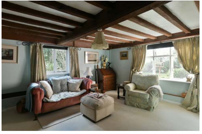
2 Turnpike Cottages, Norwich Road, Brockford IP14 5NS

Kitchen, sitting room and bathroom. Three first floor bedrooms and second floor attic bedroom and store.