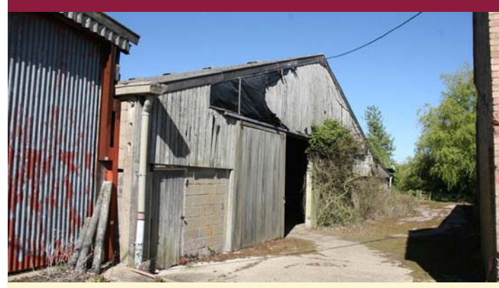
A range of agricultural buildings with scope for commercial use, subject to planning permission being obtained, available to rent, and located in a pleasant rural setting, 2 miles from Halesworth.