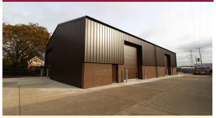
A brand new industrial unit with parking and yard facilities. Approximate gross internal area of 5,000 square feet (464.50 square metres), which can be sub-divided if required.