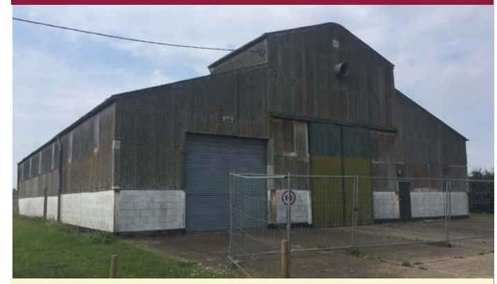
A former grain store benefitting from pp for change of use to a B1 Business Unit with office block and shower/WC facilities extending to approx 5,760 sq ft (535 sqm).