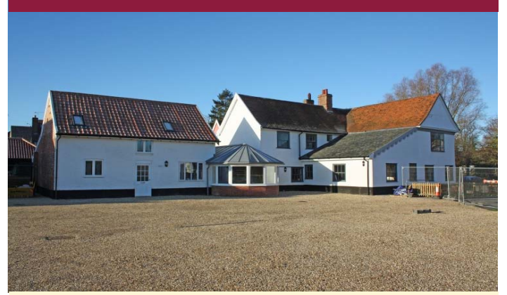
A public house/restaurant with residential accommodation, café/deli, retail unit & holiday lets in the village of Debenham. TO LET: £85,000 PAX for the whole, also available separately. Ref: P5650/J