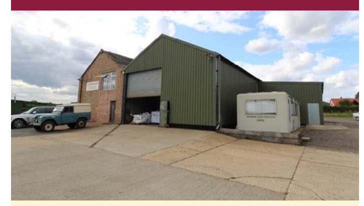
Unit 3 - An industrial or business unit with parking & yard facilities together with offices & separate stores. Approx gross internal ground floor area of 1,600 sq ft (150 sqm) with additional mezzanine accommodation.