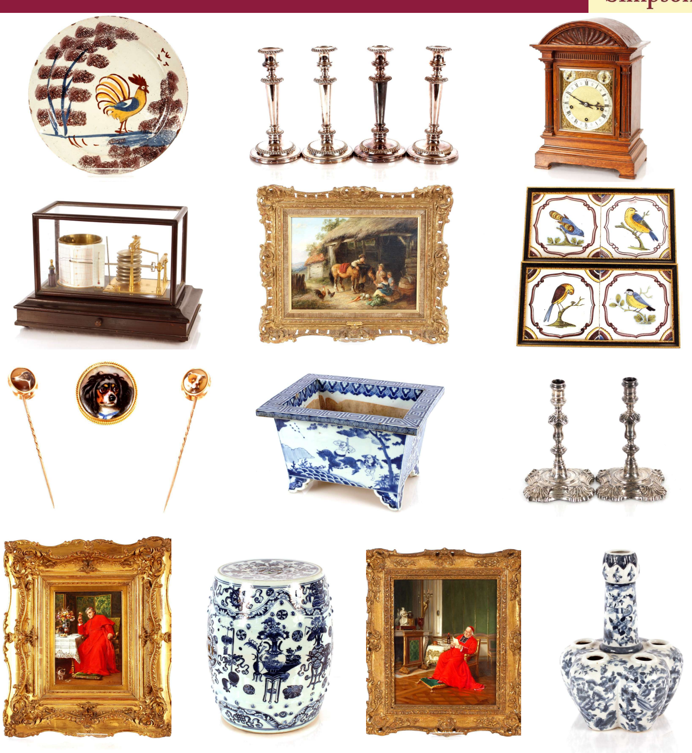
Entries Invited . . .

Art Deco, 20th Century Design & Retro, 18th June Closing date 27th May