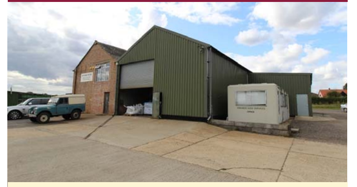
Unit 3 - An industrial or business unit with parking & yard facilities together with offices & separate stores. Approx gross internal ground floor area of 1,600 sq ft (150 sqm) with additional mezzanine accommodation.

TO LET £8,000 per annum LET STR Ref: P5838/J