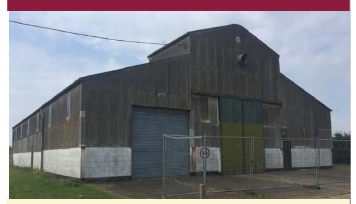
A former grain store benefitting from pp for change of use to a B1 Business Unit with office block and shower/WC facilities extending to approx 5,760 sq ft (535 sqm).