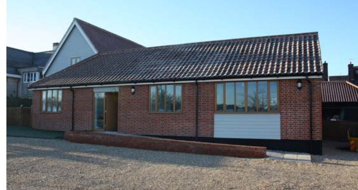
A public house/restaurant with residential accommodation, café/deli, retail unit & holiday lets in the village of Debenham.

TO LET: £85,000 PAX for the whole, also available separately.