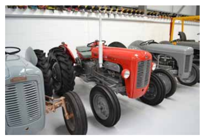
13. Massey Ferguson 35 petrol/TVO 2WD tractor. 09/02/1959. Serial number SKM129255. Showing 2403 hours. Registration SDL 839 (no paperwork). 12.4-28 rear wheels and tyres at 99%. Dual clutch and swinging draw bar.