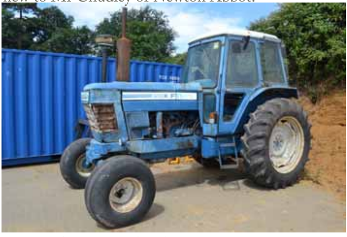
9. Ford 8100 diesel 2WD tractor. 1978. Registration CNO 413T (no paperwork). Date of first registration 09/1978. Showing 3809 hours. 16.9-38 rear wheels and tyres. Vendor reports there is a drive fault.