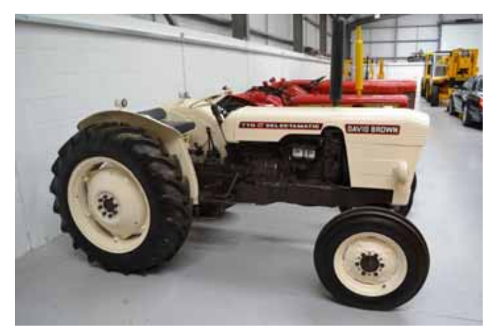
3. David Brown 770 Selectamatic 12 speed diesel 2WD tractor. 1969. Serial number 770/A 590695/ S. Registration SHO 97G. Date of first registration 27/05/1969. Showing 1180 hours. 12.4-28 rear wheels and tyres at 99%. Pick up hitch. Understood to have been supplied new to Winchester College.

2. David Brown 770 Selectamatic 12 speed diesel 2WD tractor. 1965. Serial number 770/GA 580693/S. Registration HKH 256C. Date of first registration 14/09/1965. Showing 2160 hours. 12.4 -28 rear wheels and tyres at 99%. Swinging draw bar.