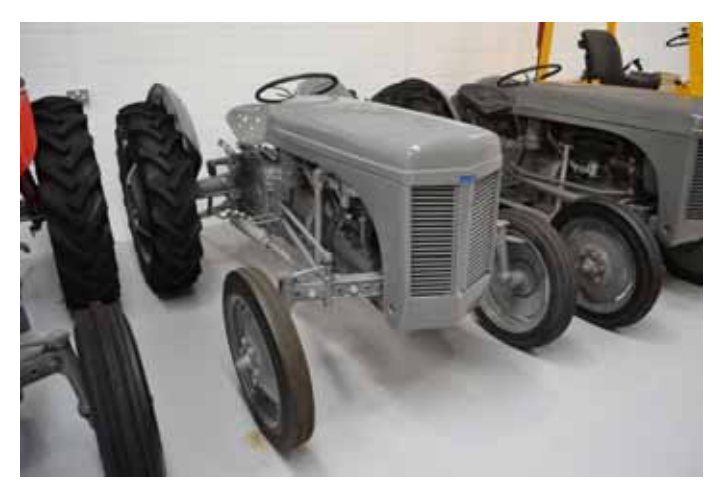
10. Ferguson TEA20 petrol 2WD tractor. 08/06/1948. Serial number TEA40357. Engine number S14184E. 11.2-28 rear wheels and tyres at 99%.