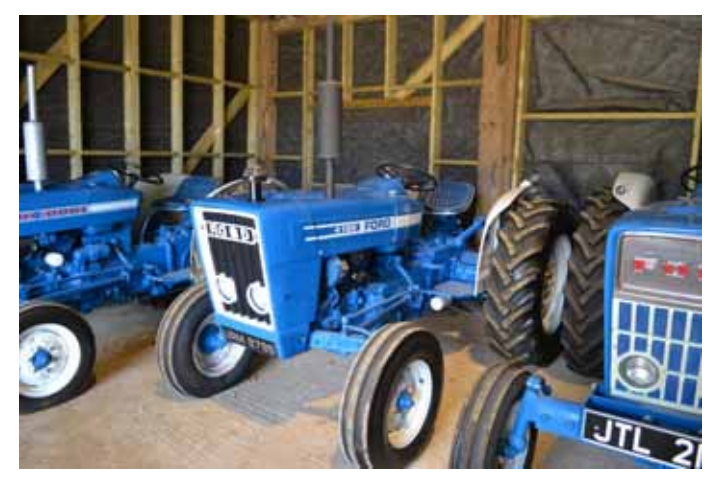
7. Ford 4100 diesel 2WD tractor. 1977. Serial number B989313. Registration URM 879S (incomplete paperwork). Date of first registration 17/11/1977. Showing 6981 hours. 14.9/13-28 rear wheels and tyres at 70%. Swinging draw bar.