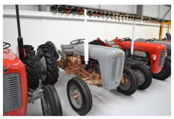
12. Ferguson FE35 23C diesel 2WD tractor. 04/02/1957. Serial number SDM14015. Showing 3.1 hours. 12.4-28 rear wheels and tyres at 99%. Pick up hitch.