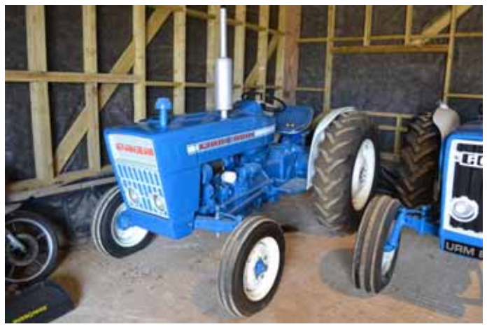
5. Ford 3000 diesel 2WD tractor. Serial number B931727. Showing 3921 hours. 14.9-28 rear wheels and tyres at 60%. Swinging draw bar.

4. David Brown 885 vineyard diesel 2WD tractor. Serial number 885N/1 646317. Registration XER 740L (expired). Showing 1064 hours. 11.2-28 rear wheels and tyres at 80%. Swinging draw bar and roll frame.