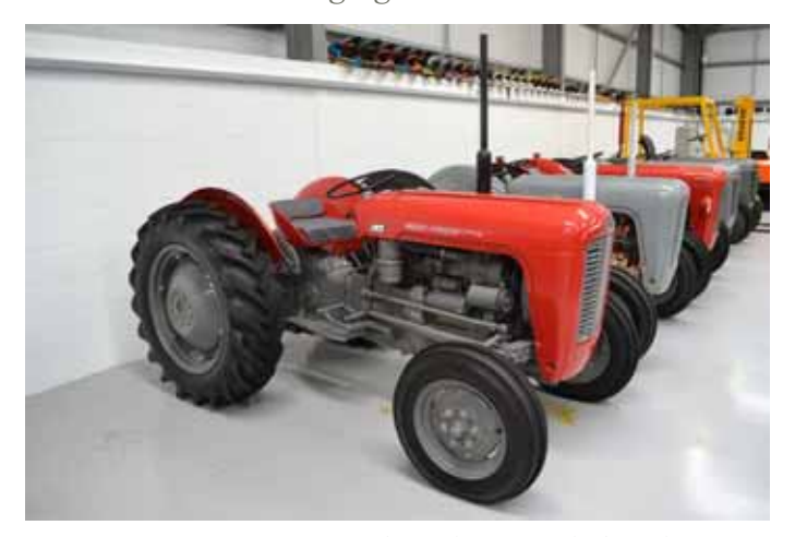
14. Massey Ferguson 35 Perkins 3cyl diesel 2WD tractor. 09/12/1959. Serial number SNM168839. Engine number 1801521. Registration 391 XUX. Showing 1001 hours. 12.4-28 rear wheels and tyres at 99%. Dual clutch and swinging draw bar.