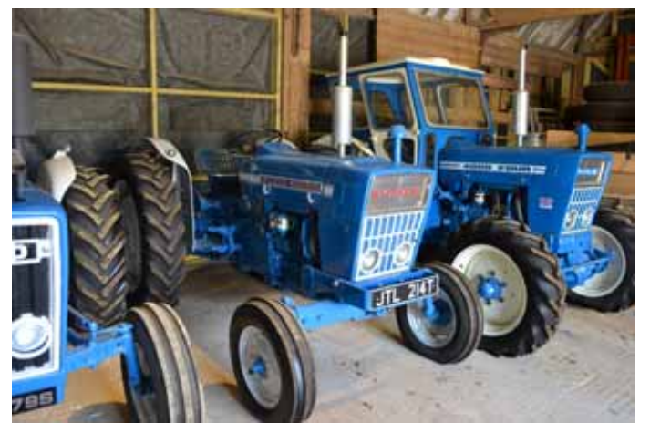
6. Ford 4000 diesel 2WD tractor. 1979. Serial number B874936. Registration JTL 214T. Showing 3934 hours. Rear wheels and tyres at 90%.

8. Ford County 4000-Four diesel 4WD tractor. 1970. Model 4000/4 type F4S. Serial number 23699. Registration UTA 750J. Date of first registration 14/01/1971. Showing 8972 hours. 9.5-24 front wheels and tyres at 99%. 16.9-30 rear wheels and tyres at 99%. Duncan cab and swinging drawbar. With copy of original sales invoice; sold new to Mr Chudley of Newton Abbot.