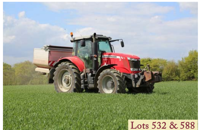
Lots 532 & 588