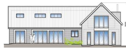
Plot 3 - Proposed Rear, North Elevation

A serviced plot with planning permission for a contemporary chalet style house that will have glimpses of the sea.