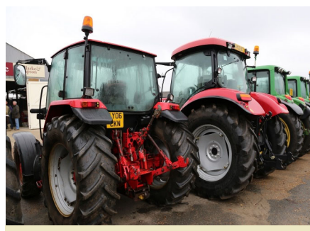
Agricultural Machinery & Plant