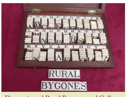
Domestic and Rural Bygones and Collect-

We hold the traditional weekly sale every Monday and regular specialised sales throughout the year!