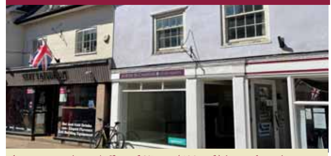
A smart retail unit/office of 37sqm (400sq.ft) located on the Market Place within the Suffolk town of Saxmundham.

Rent Incentive Available — 50% off rent for first 6 months. Available Immediately, New RICS Retail Lease Available.