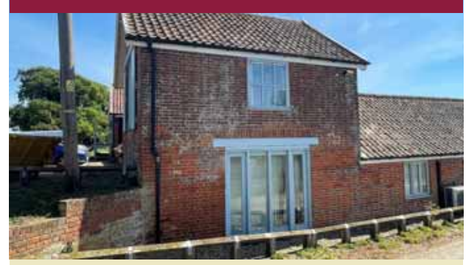
A former Victorian dairy, that now offers office, studio and workshop facilities in a delightful rural location just outside Orford. First Floor office/studio space extending to 280sq ft (26sq m). Available Immediately.

TO LET FROM £2,520 PAX + VAT Ref: C931/1/JG