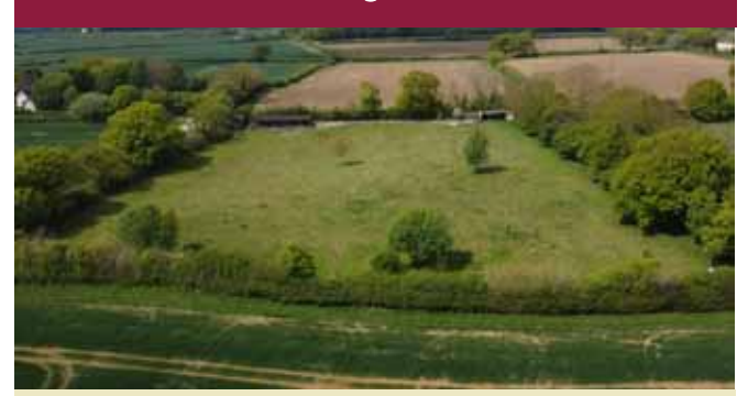
A rural development site of over 3 acres with planning permission for 6 holiday lodges, associated buildings & landscaping in the popular village of Hasketon, near Woodbridge.