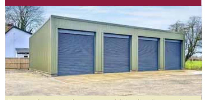
Four brand new B2 industrial units of 520sq.ft each, situated just off the A12 at Copdock.

Each unit benefits from a small kitchen area, wc, 2 allocated parking spaces and electric roller shutter door to front.