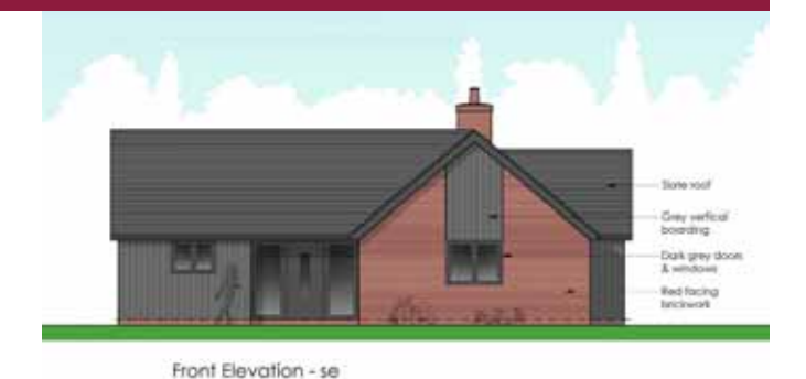
A central village building plot with planning permission for a self build three bedroom bungalow with garage.

A building plot extending to approximately 0.22 acres (0.09 hectares) 1,300 square feet (118 square metres) of accommodation. Garage and driveway. Gardens to front and rear.