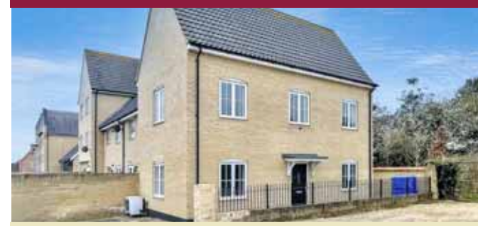
A smart business unit/office premises, situated in the town of Framlingham, Suffolk.

Arranged over ground and first floors, and extending to over 900 square feet (85 sqm) with car parking facilities. Available Immediately.