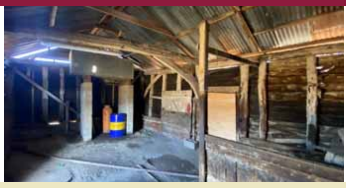
A Grade II Listed Suffolk barn with planning permission for conversion to a stunning five bedroom dwelling, just outside the village of Somersham.

The barn has planning permission and listed building consent for conversion to an impressive single dwelling of approx2,600 sq ft (243 sqm) on a site of approximately 0.12 acres (0.05 hectares).