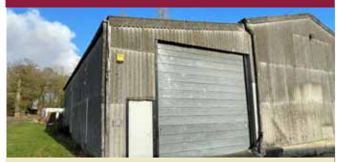
A storage barn / workshop of 106sq.m situated in the rural village of Worlingworth.

Storage barn/warehouse/workshop of 106 sq.m (1,139sq.ft) last in agricultural use. Single open plan space with large roller shutter door for vehicle access. Available Immediately.